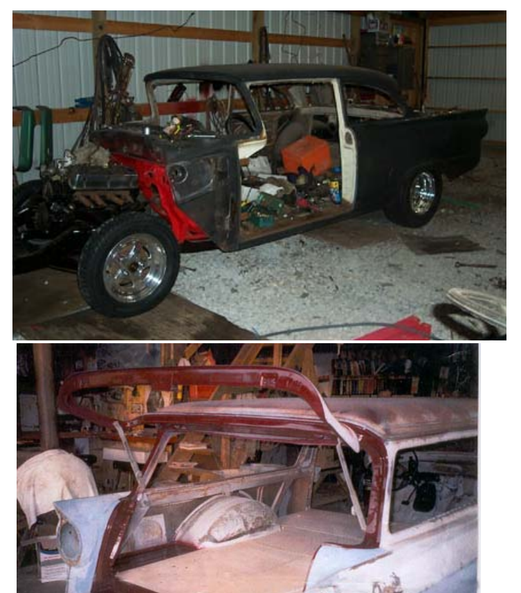
Albert must have thought if one is good, two is better. This `57 Ranch Wagon is another of Alberts projects. It features stock suspension and wheelbase, but has been cleverly tubbed by straightening the rear frame section. The wheel houses were split and 3 inches added. It is to be powered by a 390 and 4 speed. See club site for more photos.

Shades of gassers past. Member Albert Schaper is building this altered wheelbase, straight axle suspended 427 fuel injected screamer. Albert says it has a 427 stroker, Jerico 4 speed, and Hilborn stack injection. Very cool. Other mods include moving rear axle ahead 10 inches and engine back 8 inches. Check club site for more pics.