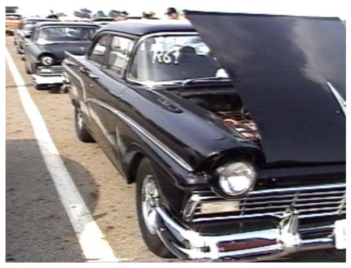
This lineup in the staging lanes was impressive.