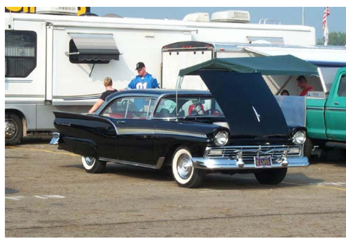
Unidentified, beautiful black Fairlane 500 hardtop.