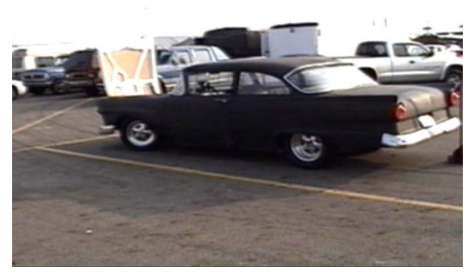
My own `57 sat in the pits in this condition most of the weekend, victim of a toasted starter.