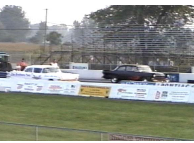
Joe and Allan face off in the final round of the `57 Ford Shootout