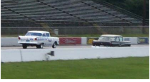
Ford Expo 2004 Coverage Inside!!