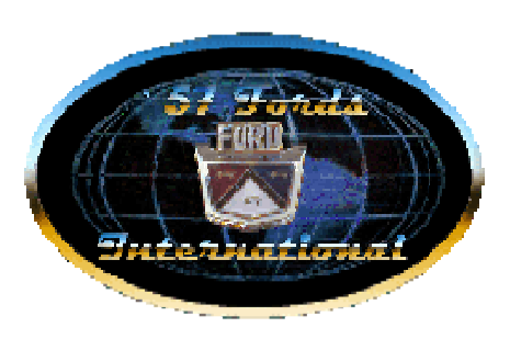
Dedicated Solely to the 1957 Ford Passenger Car