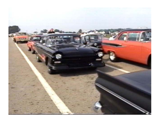
Waiting for another turn at the 1320.