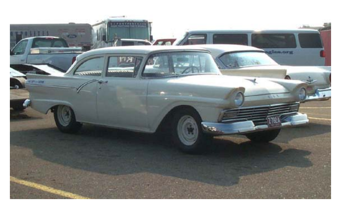
Dunc's cool Custom 300, converted to 70A trim.