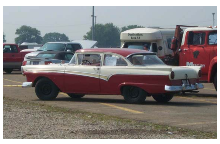
This nice Custom 300 with good body was for sale at $3500.

John Gambill had his lovely low mileage Custom on hand. It features original 223 six cylinder, and low stance, and has seen only 15,000 miles.