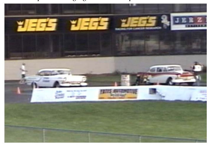
Feistritzer and Fuzsner face off in the Y-Block Shootout.