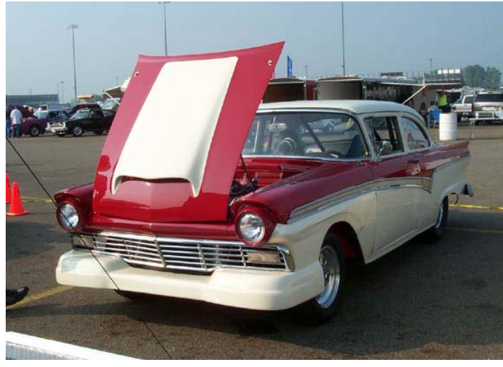
Dave Fuzsner has a cool old Y-block powered `57 Custom 300.